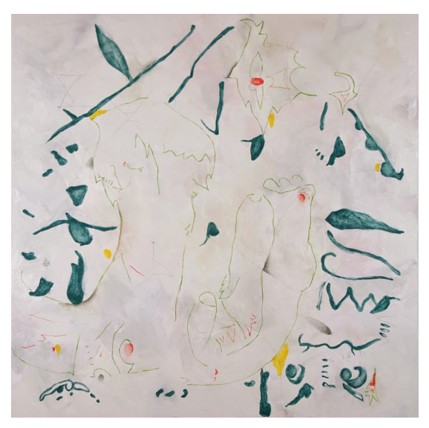
Gentle Land, 2013, oil on canvas, 36x36"

AS: Like in your work, you can see a layer of something that was there before.