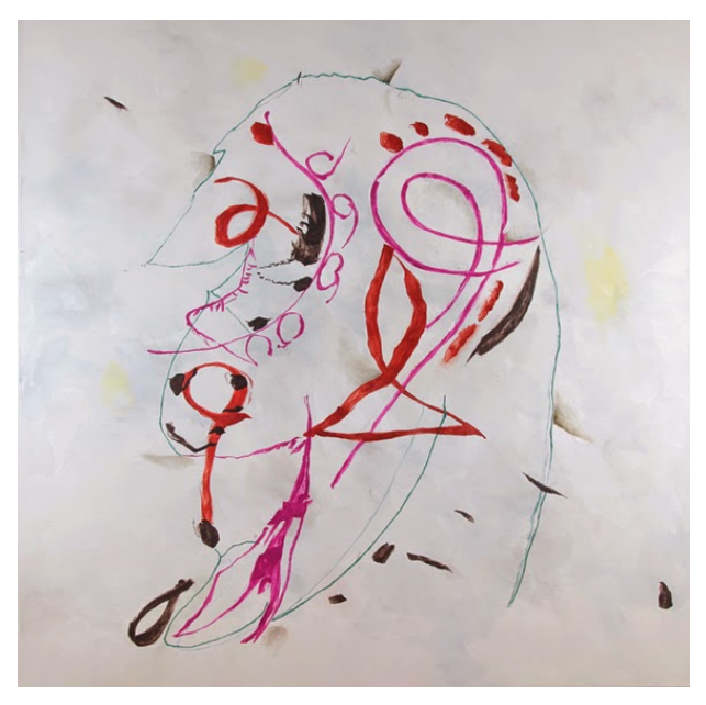
Just Like a Prayer, 2013, oil on canvas, 54x54"

JM: Yes, in a way it's a mental analysis and I think of it as to do with the construction of one's identity, as a person, and what does it mean to be a conscious being. So, looking at what I have done, this thing I have created, and trying to make sense of it by translating it into a painting.