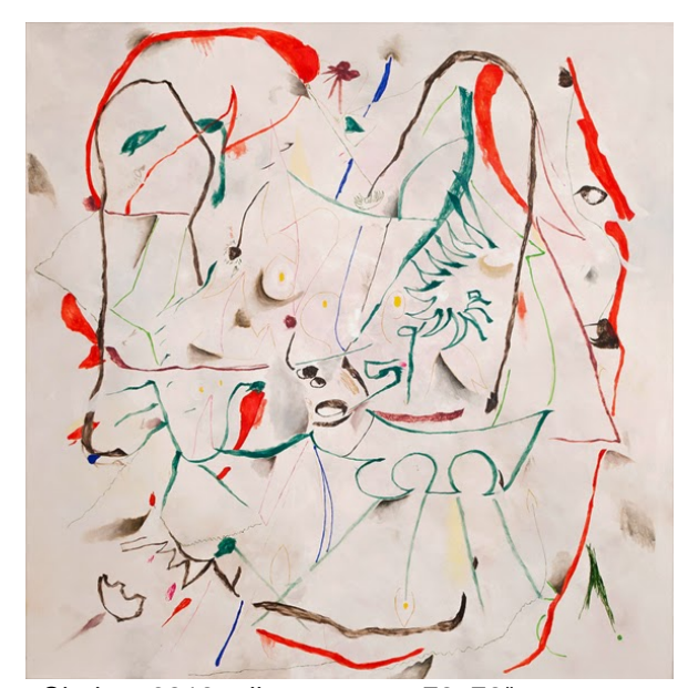
Shelter, 2013, oil on canvas, 78x78"

and for some reason that's when it started to click for me. The space was too empty and simple so I needed this complexity. A very different thing happens in a drawing and in a painting. As a thing, a painting has depth, it has tactile surface, paint, brushstrokes, subtle changes in colour, where this line is heavier here and these are all little subtleties that make a painting a painting. A drawing is a simple thing, that is beautiful, but when it becomes a painting then it becomes much bigger than what it was originally.